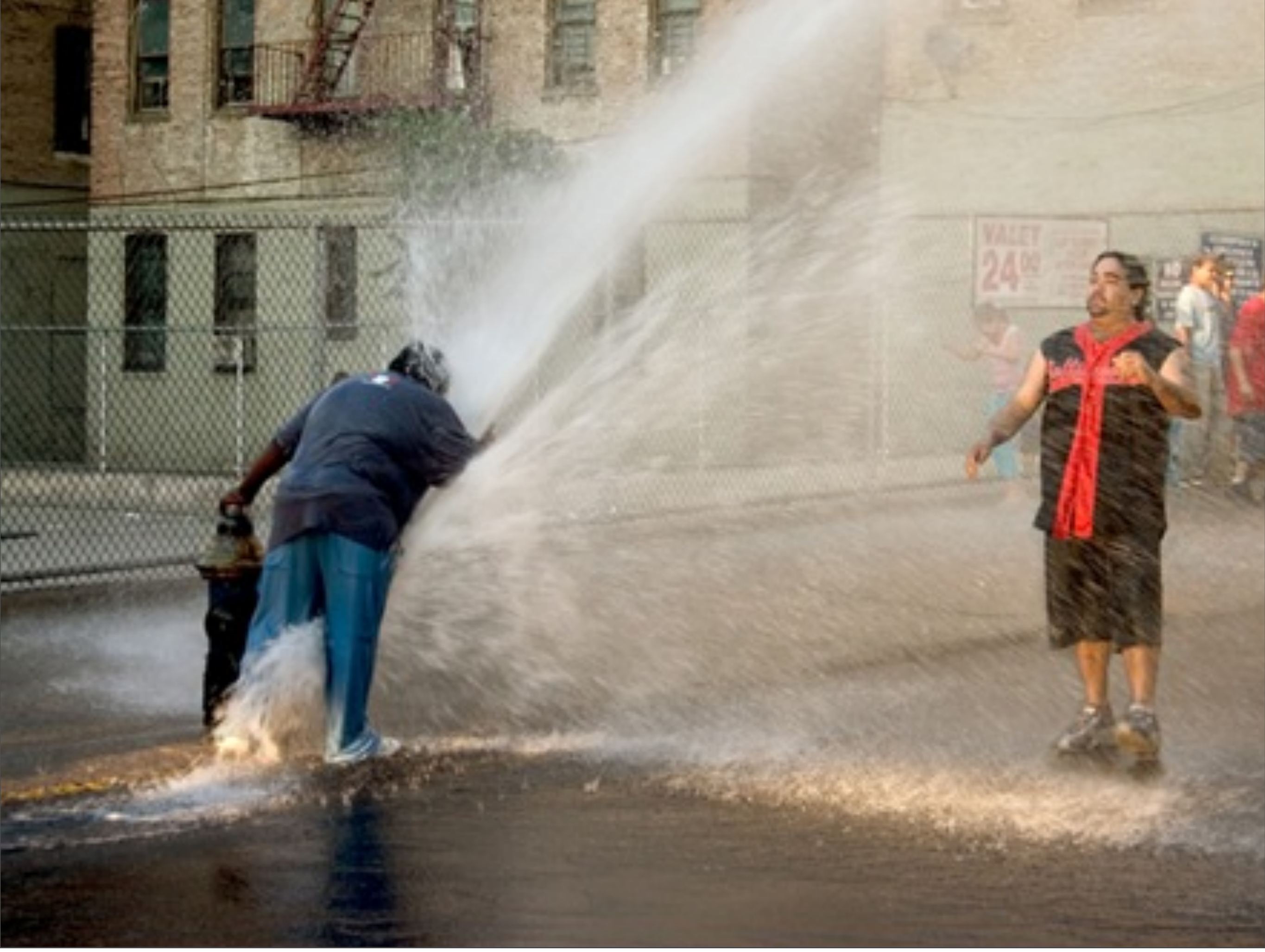
Tuesday, 10 January 12