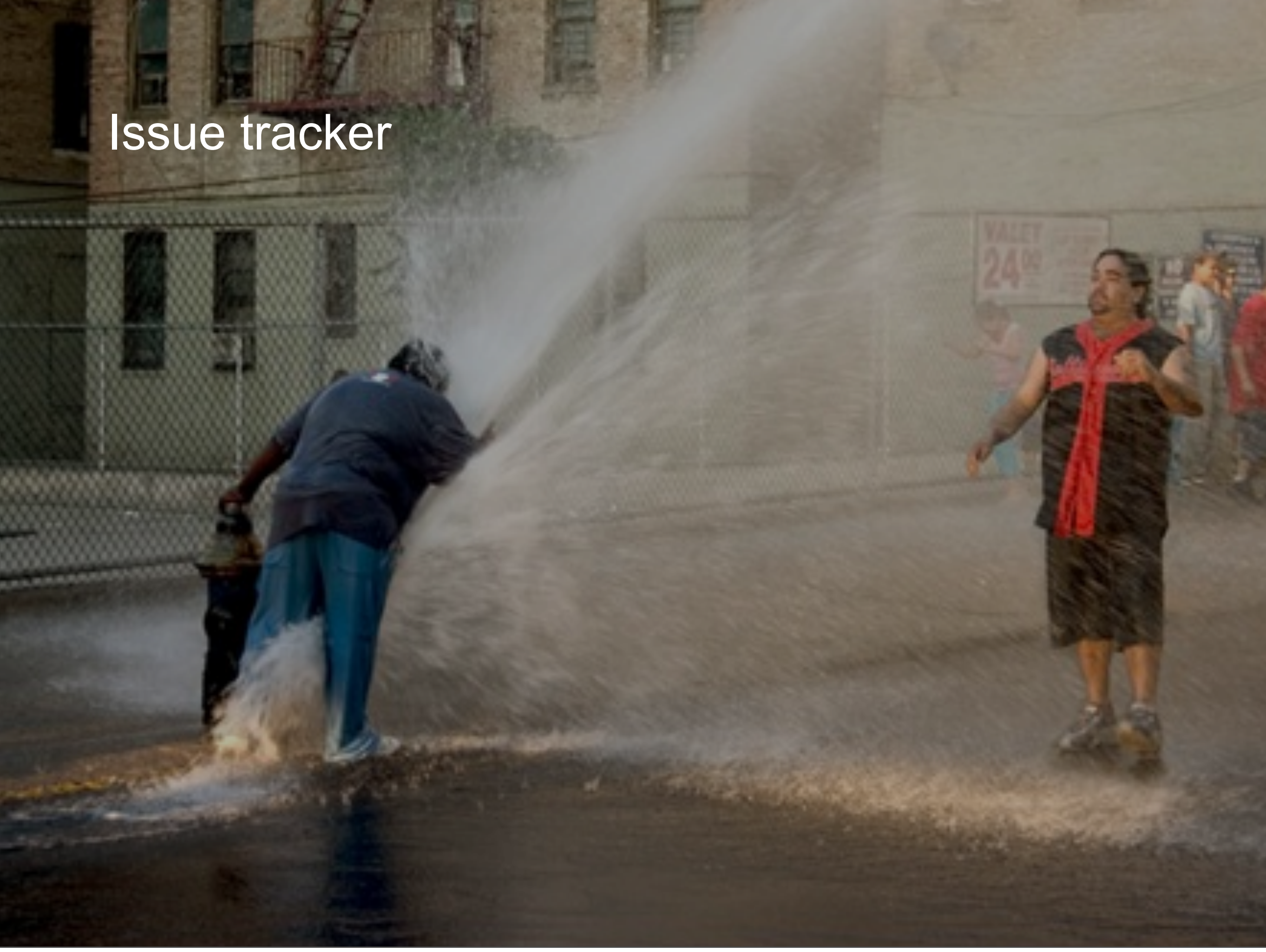
Tuesday, 10 January 12